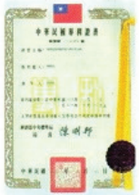
專利號第 117357 號