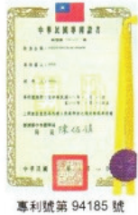
專利號第 94185 號

TRANSFORMER HAND TYPE LAMINATION STACKING MACHINE