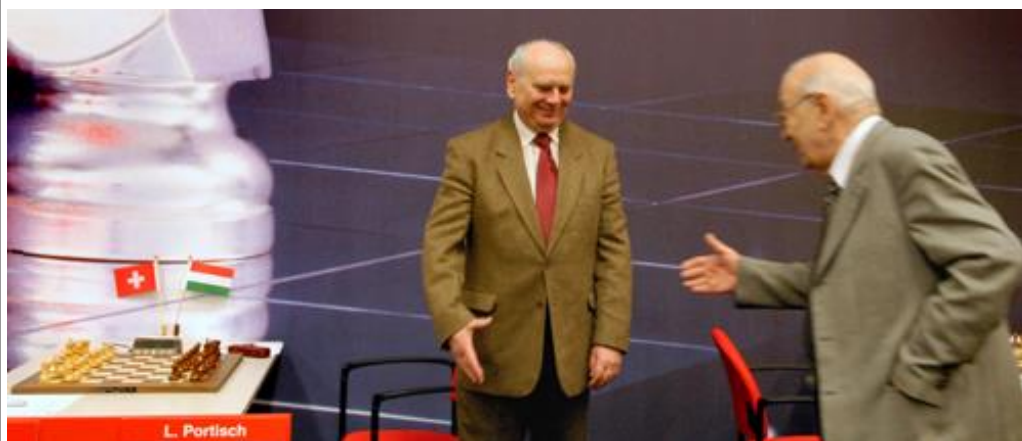
Portisch (left) and Korchnoi shaking hands, Corus Honorary Group in 2008, Victor won both games. They first met otb in 1961 (Maroczy Memorial), and last in 2011 (Botvinnik Veterans Memorial, Rapid)

Korchnoi , aged 52, won easily with 6-3, winning already three of the four first games.