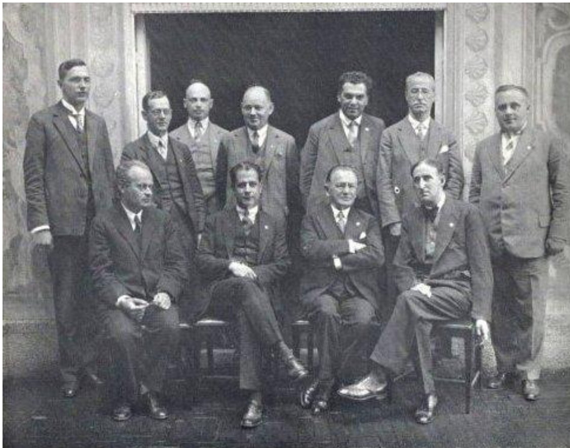
Euwe, Yates, Tartakower, Spielmann, Réti, Mieses, Bogoljubow Nimzowitsch, Capablanca, Tarrasch, Marshall (Rubinstein is missing)