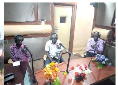
Teenagers receiving soap during the awareness raising sessions and leading the chat radio show.