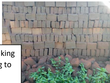
Parents have already started making bricks whilst looking for funding to build a new classroom.