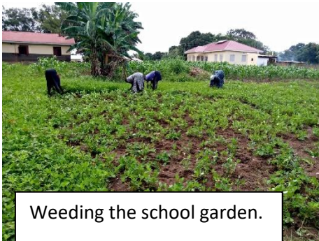
Weeding the school garden.