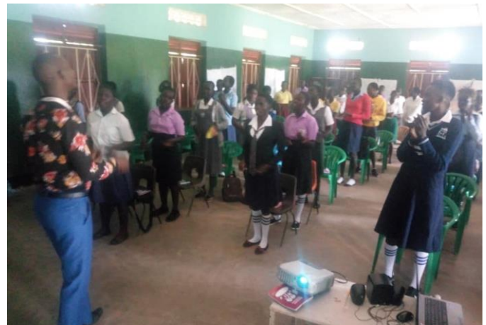
Young people during awareness raising the teaching sessions.