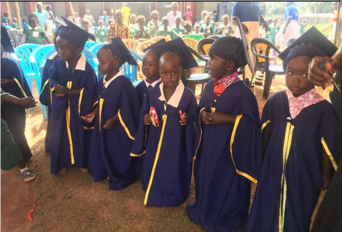
Nervous children waiting to receive their graduation certificates.