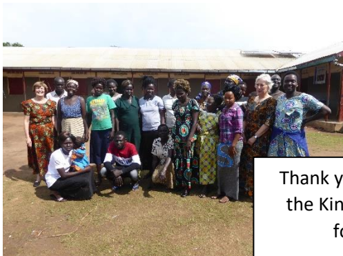
Thank you from all the team involved in the Kindergarten as we hopefully look forward to a healthy 2021.