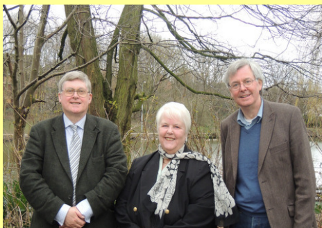
Your Edgeley and Cheadle Heath Labour Team