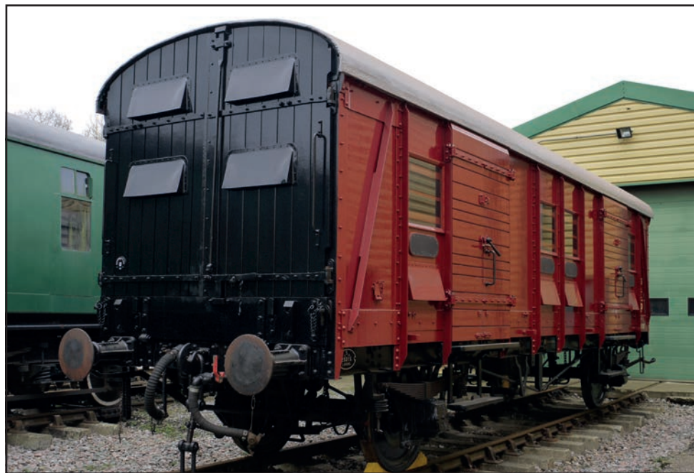
The restored CCT at Horsted Keynes in January 2020.

The 2020-2021 Coronavirus pandemic, and consequent lockdowns, have meant that we've been unable to raise any money for over a year. For the Intermediate overhaul we have contributed £35,000 towards the cost of the materials used. This, is at a time when the Bluebell Railway has itself been under significant financial pressures, due to the Coronavirus pandemic restrictions. Our contribution has depleted the Society's financial reserves, which we need to replace, so we can help again at future overhauls.