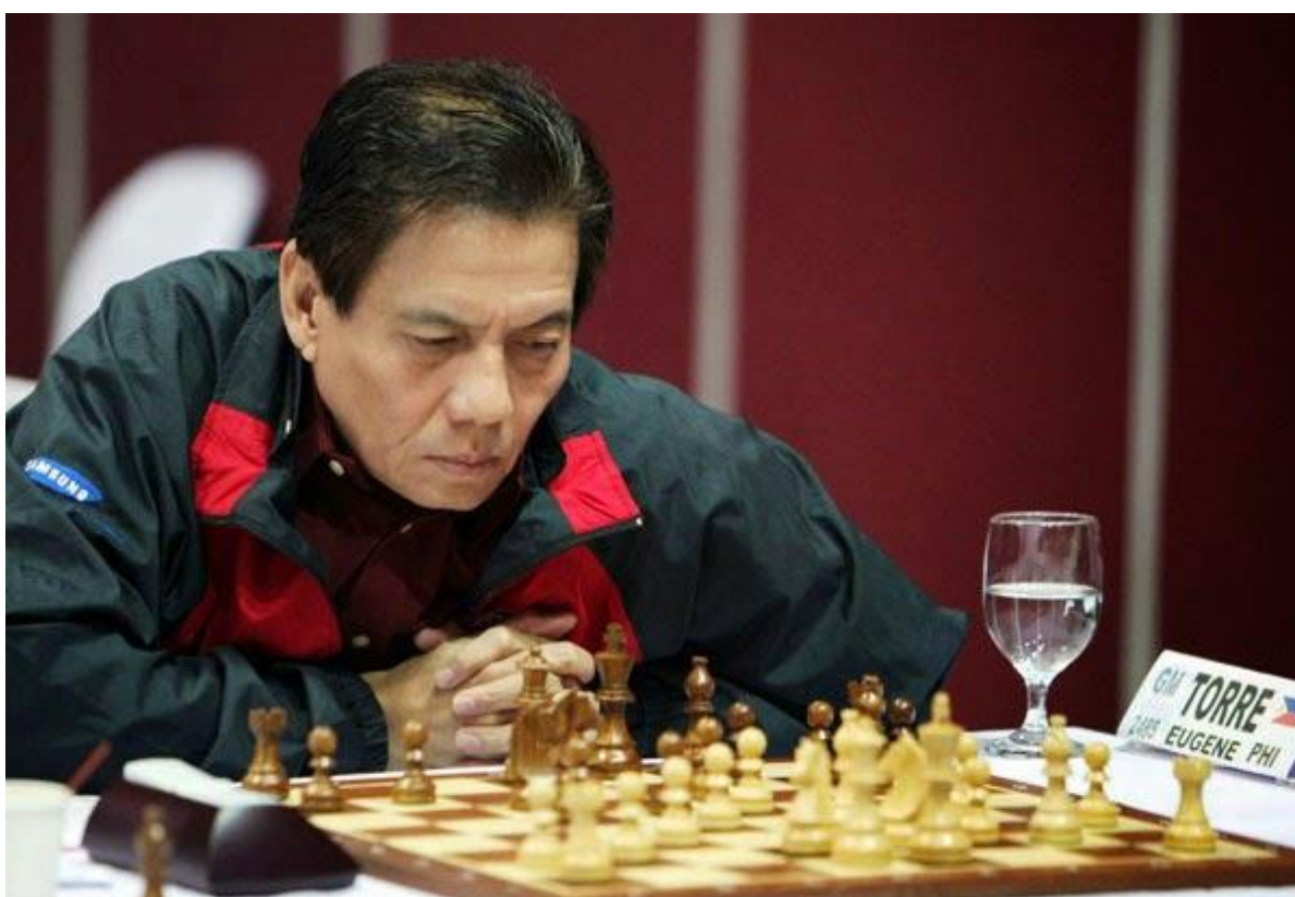
Torre: Mr. Olympiad and first Asian GM

Manila (Marlboro-Loyola Kings Challenge) 1976: http://www.chessgames.com/perl/chess.pl?tid=80013 Toluca, Mexico, Interzonal 1982, joint with Portisch: http://www.mark-weeks.com/chess/82843iix.htm San Francisco (Pan Pacific) 1991: http://www.thechesslibrary.com/files/1991SanFrancisco.htm