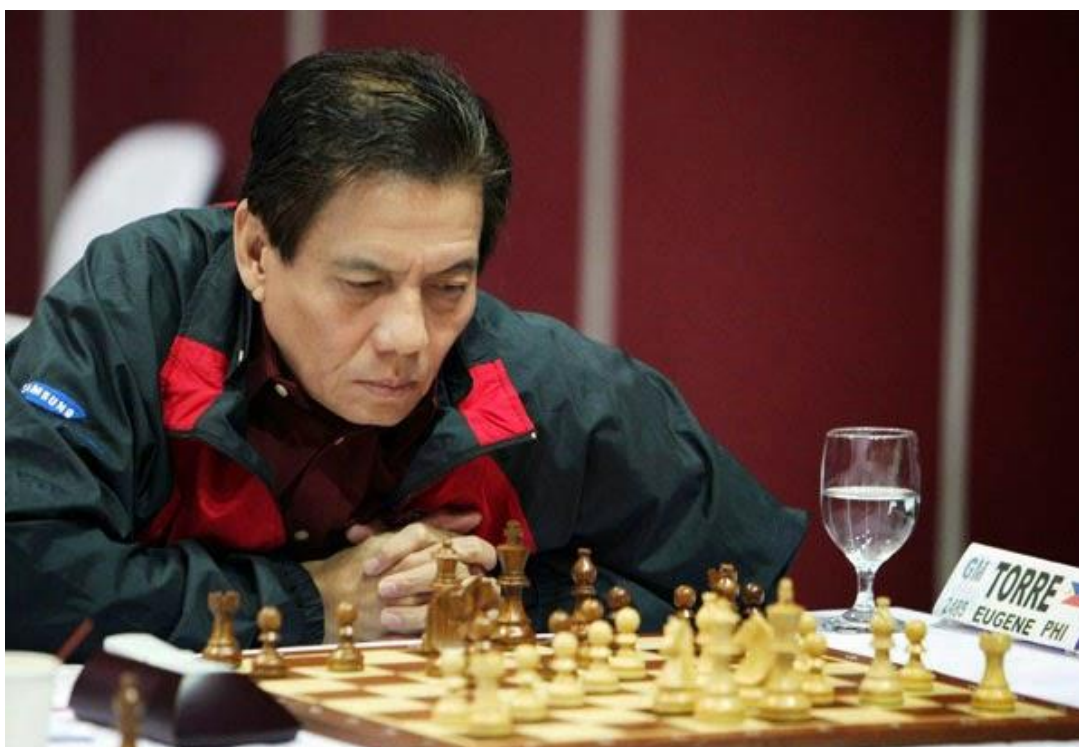
Torre: Mr. Olympiad and first Asian GM

Manila (Marlboro-Loyola Kings Challenge) 1976: http://www.chessgames.com/perl/chess.pl?tid=80013 Toluca, Mexico, Interzonal 1982, joint with Portisch: http://www.mark-weeks.com/chess/82843iix.htm San Francisco (Pan Pacific) 1991: http://www.thechesslibrary.com/files/1991SanFrancisco.htm