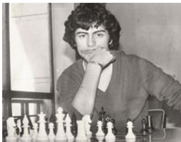
GM Ivan Eduardo Morovic Fernandez

https://es.wikipedia.org/wiki/Iv%C3%A1n_Morovic (Wikipedia, Español )