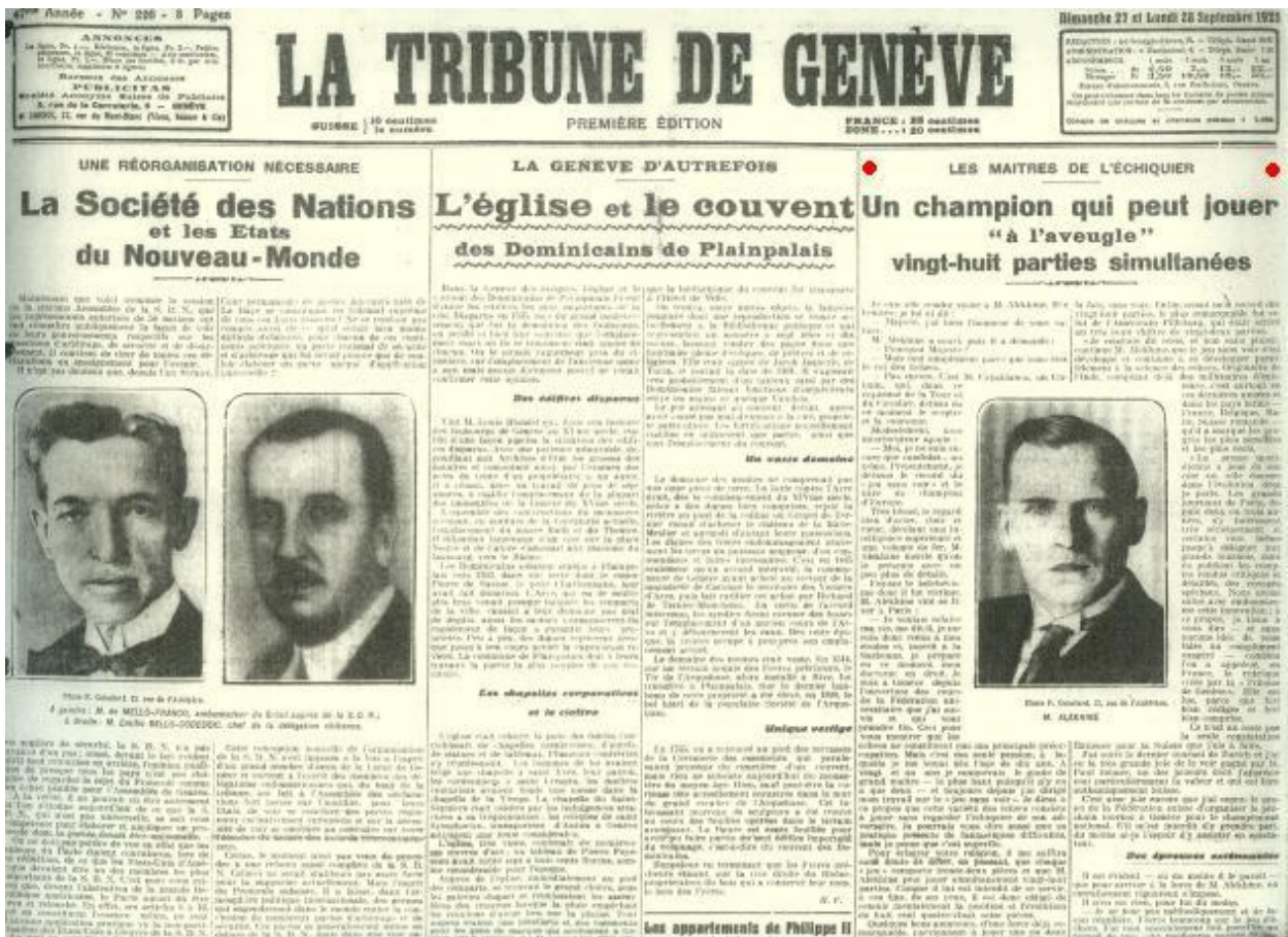
Tribune de Genève, 27-28 September 1925. Alekhine 48 parties simultanées

The Geneva chess history starts with simultaneous chess displays of Alexander Alekhine in 1925, 1928 and 1933: