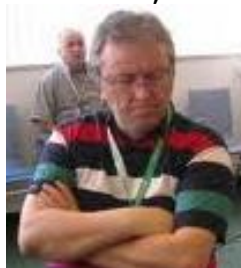
Croatian Grandmaster (1983)

His major victories includes: Monte-Carlo and Montpellier 1977, Vinkovci 1978 , London 1979, Linz 1980, Timisoara 1982, Caorle 1982, Thessaloniki Open 1984, Angouleme 1986, Pula 1987, Montpellier 1988 and Geneva Open 1989.