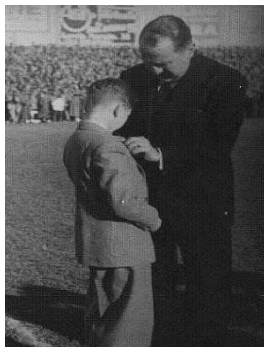
Arturo Pomar Salamanca in 1951