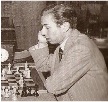
Arturo Pomar Salamanca in 1951

The real successes of Pomar Salamanca began at the end of the fifties. He qualified for the Zonal in Madrid 1960. The event ended tragically for Jan Hein Donner. The Gran Torneo of 1973 did not happen in Palma de Mallarco but in Madrid's Castellana Hilton. Three Soviet players dominated the event, Karpov won ahead of Tukmakov. Pomar Salamanca neared the end of his chess career.