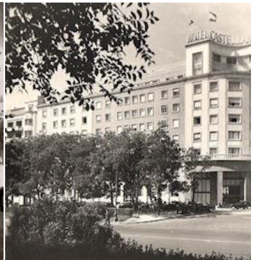
Castellana Hilton, playing hall 1973

Winners in Madrid , earlier international invitation tournaments (played in unregular intervals)