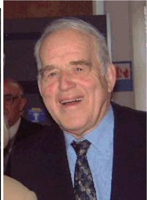
Unzicker playing Uhlmann at the Olympiad in Leipzig 1960, and in later years