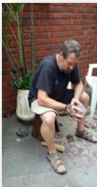
Knapping stone tools!

Come and find out about the “Pre-feasibility Study for the Sibudu Cave Experience” from the iLembe District Tourism Strategy