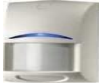
Passive Infra Red Sensor