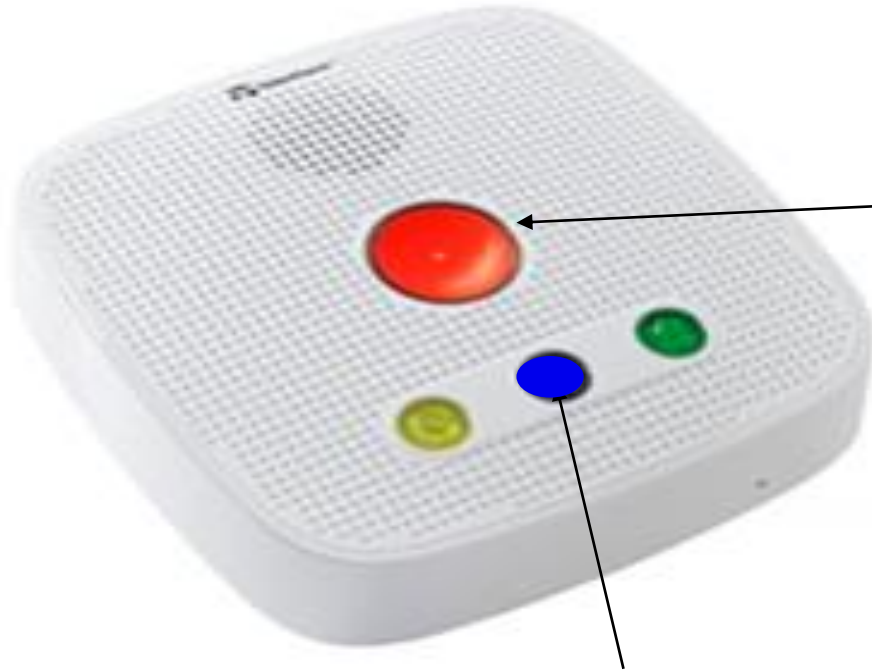
Emergency call button.