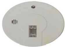
Monitored Smoke Alarm